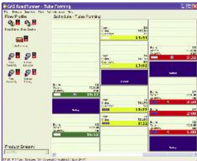
Shows the constraint schedule, order status, and location of late orders through the plant ensuring on-time performance.