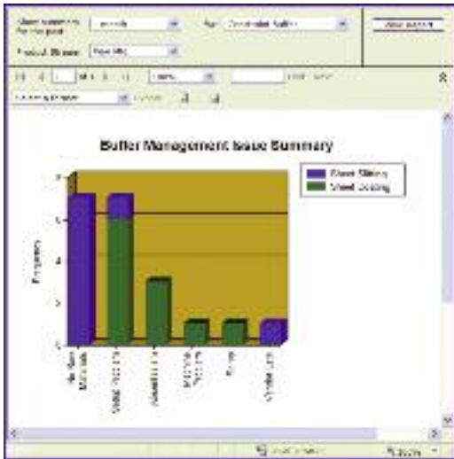
Shows the Pareto Diagram of prioritized order flow interruptions.

CMS RoadRunner will increase your net profit by: